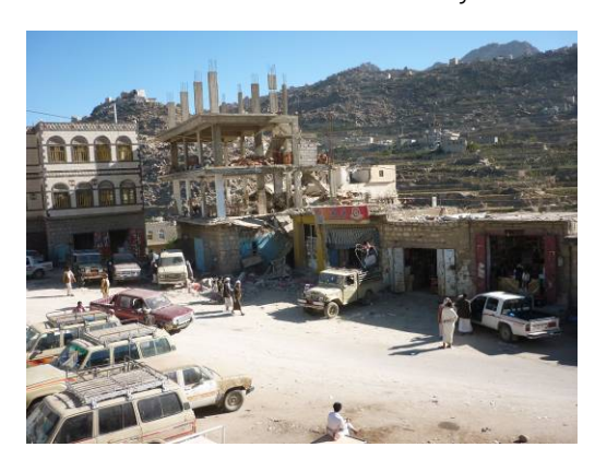
A bombed market place, Sa'dah, Yemen, March 2010

Among other unpublished terms of the ceasefire agreement are said to be the release of those held by the Yemeni authorities in connection with the conflict, including prisoners who have been tried and sentenced as well as those who were held awaiting trial; and the formation of a national implementation committee comprising members of Yemen's political parties. When this committee was set up, it was composed of 27 members of the House of Representatives and the Shura (consultative) council and representatives of an umbrella group of opposition political