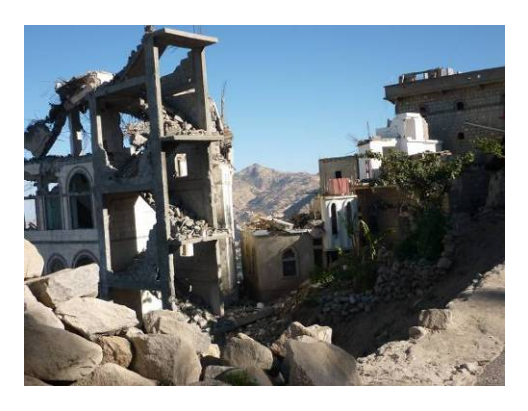
Building destroyed by aerial bombardment, Sa'dah, Yemen, March 2010

Yemeni government restrictions on access to the region combined with the prevalence of land mines and other security concerns arising from the presence of Huthi fighters and Yemeni security forces meant that virtually no independent observers or media visited Sa'dah during the sixth round of fighting or in the weeks that followed the truce. However, evidence of the scale of death and destruction began to emerge as people who fled their homes began arriving in safer areas, including the capital. A member of one of four post-ceasefire local committees who had visited the region, described the devastation, stating that three-quarters of the old city of Sa'dah had been completely destroyed.