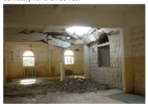
Inside a building that took a direct hit, Sa'dah, Yemen, March 2010

The witness, a man from al-Nadir, said he had fled his home between 20 and 25 December 2009 with 30 members of his family because they "had just had 10 days without sleep because of the Saudi planes constantly circling above the town" and "had seen more and more dead bodies." He said an attack by Saudi Arabian forces in November on three family homes left 36 people dead: "So many were killed from one family that they had to create a cemetery for themselves."