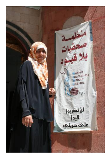
Tawakkol Karman

Three days earlier Amnesty International delegates experienced first-hand the authorities' hostility towards coverage of protests in defence of free speech. As they watched a peaceful demonstration in Sana'a organized by Women Journalists Without Chains, police threatened to arrest and bring charges against an Amnesty International delegate who was carrying a camera if any attempt were made to photograph the peaceful march, and said it was illegal for the delegates even to be present although the women journalists were holding their protest peacefully and in a public place. The Amnesty International delegates also witnessed the arrest of a protester who was carrying a camera, though he was released when other protesters complained about this, though the police kept his camera. Meanwhile, men in plain clothes who appeared to be security personnel filmed and photographed people involved in the demonstration.