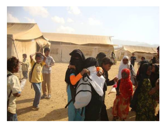
Al-Mazraq camp for IDPs in Harad district, Hajjah governorate, Yemen, January 2010

By March 2010, according to UNHCR, around 280,000 Yemenis from the north were displaced, many of them for the second or third time. Humanitarian organizations told Amnesty International that of those displaced, only 10 per cent of them were in the camps; the rest had found shelter with friends and relatives, or in derelict buildings, rented accommodation, the grounds of mosques, and open spaces. Local activists told Amnesty International that they were struggling to provide assistance to the displaced from Sa'dah because of lack of resources, and that