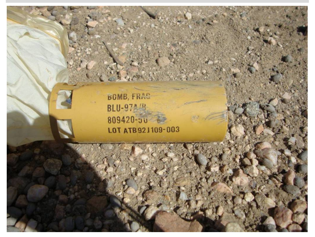
Part of a cruise missile carrying cluster munitions, Yemen

At dawn on 17 December 2009, missiles were fired at two settlements in al-Ma'jalah area in al-Mahfad district of Abyan. By the time the attack was over, at least 41 people lay dead, 21 of them children and 14 of them women. The Yemeni authorities announced that the attack had targeted a "terrorist training camp". They acknowledged that some women and children might have been killed, but denied any responsibility, claiming that al-Qa'ida had brought families into the camp and so were exclusively to blame for any deaths of women and children that had occurred as a result of the attack.