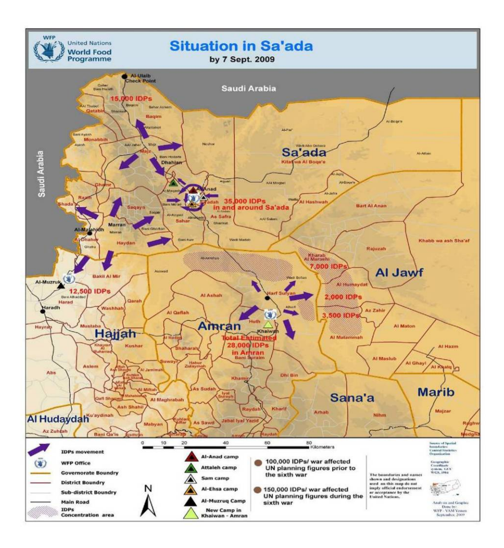
World Food Programme map of Sa'dah humanitarian assistance © WFP

In November 2009, the fighting spilled over the border with Saudi Arabia, which deployed its army and air force against the Huthis in Sa'dah. There followed weeks of heavy bombing of Sa'dah, particularly Razih, by Saudi Arabian planes which is reported to have killed hundreds of people and caused widespread damage to homes, other buildings and infrastructure.