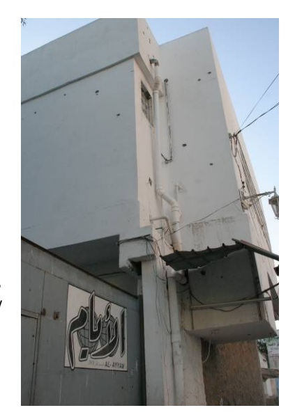
al-Ayyam building damaged by bullets

The independent media came under sustained attack after newspaper coverage of protests that took place in the south in the run-up to 27 April 2009, the 15th anniversary of the start of the civil war of 1994. On 30 April the authorities confiscated every copy of al-Ayyam , Aden-based and one of Yemen's largest-circulation daily newspapers, from news stands and distribution points in Sana'a and southern cities. In early May they took similar action against several other newspapers, and security forces physically blockaded the offices of al-Ayyam to forcibly prevent distribution of the paper. The government also announced a suspension of all newspapers that it considered were harming the unity