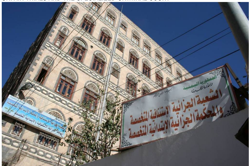
Specialized Criminal Court in Sana'a

Many detained security suspects and critics of the state are held without charge or trial but others have been prosecuted before the courts, notably the Specialized Criminal Court, where trials are generally reported to fall short of international standards of fair trial. In practice, abuses of defendants' rights to fair trial begin before the case even reaches court with security suspects and those targeted because of their criticism of the government being frequently subjected to arbitrary arrest, enforced disappearance and incommunicado detention during which they are denied access to lawyers and liable to torture and other ill-treatment, often to extract "confessions" that can then be used as evidence for their prosecution.