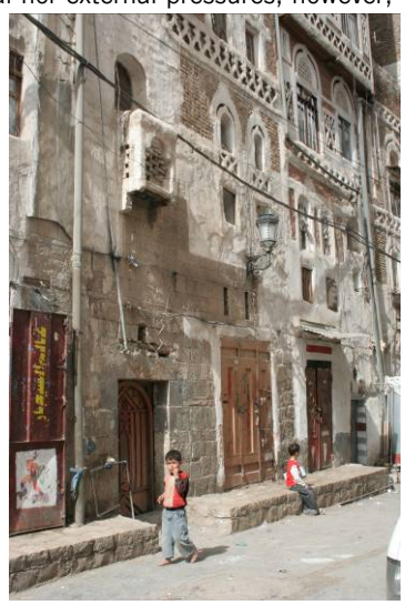
Children in old Sana'a

Yemen also faces a dire economic situation.<sup>2</sup> Around a third of its 24 million people suffer chronic hunger 3 and nearly half live on less than US$2 a day.4 Some 43 per cent of children aged under five are undernourished,5 reflected by the ubiquitous street children begging or selling their cheap wares, and young people suffer extremely high levels of unemployment. Millions of Yemenis are still suffering the consequences of their government voting against the UN Security Council's resolution to use force after the 1990 invasion of Kuwait by Iraq,6 which led to most international aid being cut and hundreds of thousands of Yemeni workers being expelled from Gulf states, primarily Saudi Arabia. All these factors have left Yemen ranked 140 out of the 182 countries listed on the human development index, a comparative measure of life expectancy, education and