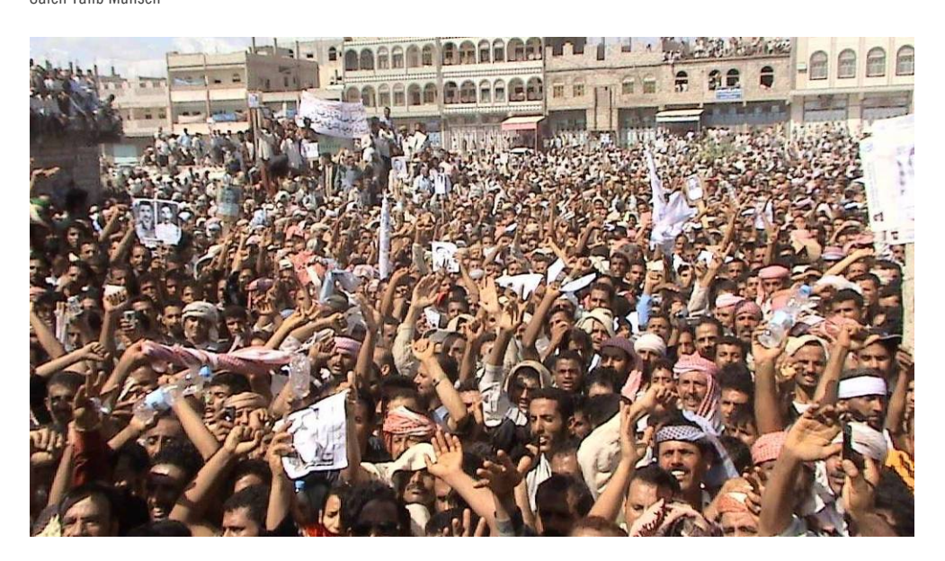
Mass demonstration, south Yemen, 2008

In 2009, Yemeni security forces killed at least 46 people in or near demonstrations, including funeral march processions for activists killed in previous demonstrations, and injured at least 164. In the first six months of 2010, at least 20 more people have been killed and 87 injured. Members of the security forces have also been killed during protests at least 15 have been killed since the beginning of 2009, according to media reports.