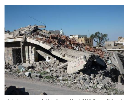
A destroyed house, Sa'dah, Yemen, March 2010. The graffiti reads "This is the help Yemen gets from America"

'bombings, missiles', and laid flat on my stomach. Then the market turned to a screaming area, smoke, shrapnel, dust, stones and broken windows everywhere... scene that can only be from doomsday..."